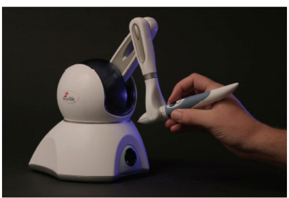
Fig. 1: The used force feedback system Phantom® Omni™ and FreeForm® Concept ™, SensAble Technologies, USA

Keywords: breast, 3-D surface imaging, breast surgery, force feedback, surgical planning