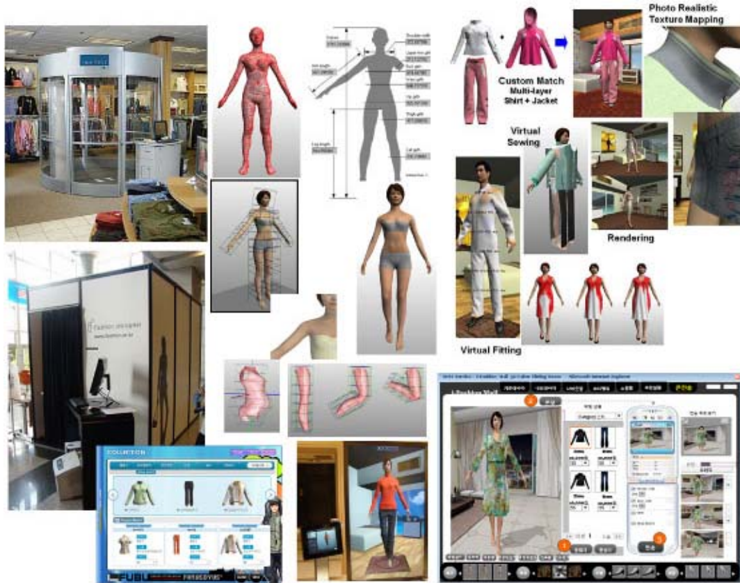
Fig.1. Digital fashion service for apparel shopping.