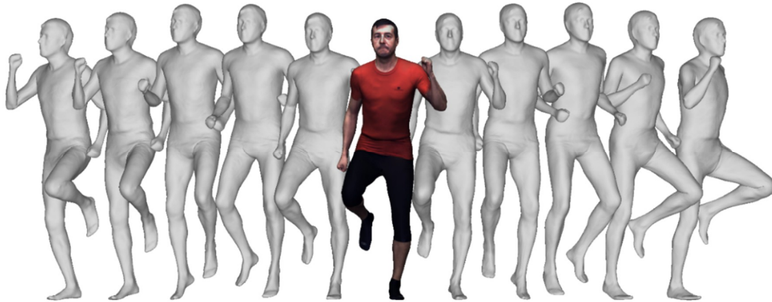
Figure 1: Sample frames of a 3D-in-motion sequence captured with MOVE4D