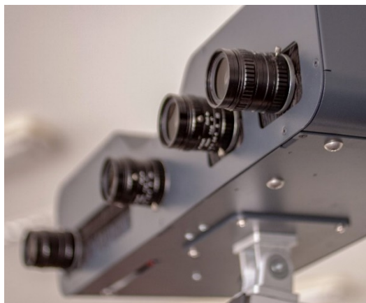
Figure 2: Detail of MOVE4D module